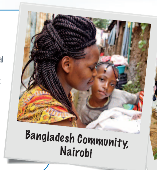
Bangladesh Community, Nairobi