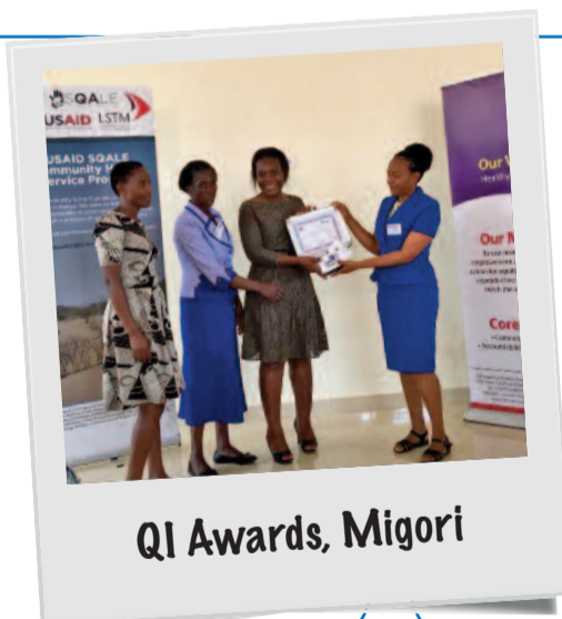
QI Awards, Migori