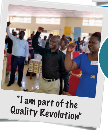
"I am part of the Quality Revolution"

The USAID SQALE CHS Program is made possible by the generous support of the American people through the United Agency for International Development (USAID) and is implemented under cooperative agreement number AID-OAA-A-16-00018. The programme is managed by prime recipient, Liverpool School of Tropical Medicine.