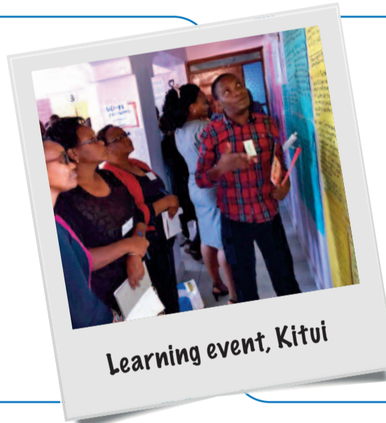
Learning event, Kitui